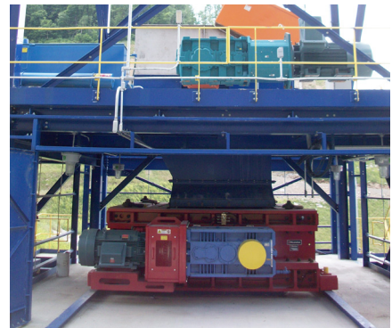
DDC-Sizers can be installed on rails for easy, safe access.