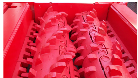
A variety of roll designs and tooth configurations are available based on a customer's application needs.