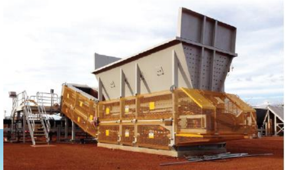
Hopper Opening of 6m Suits Most Front End Loaders